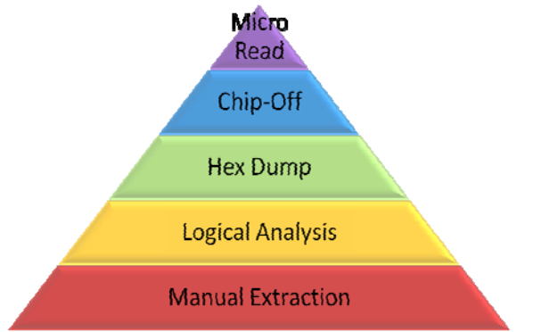
Figure 4: Cellular Phone Tool Leveling Pyramid – (Brothers 2009)